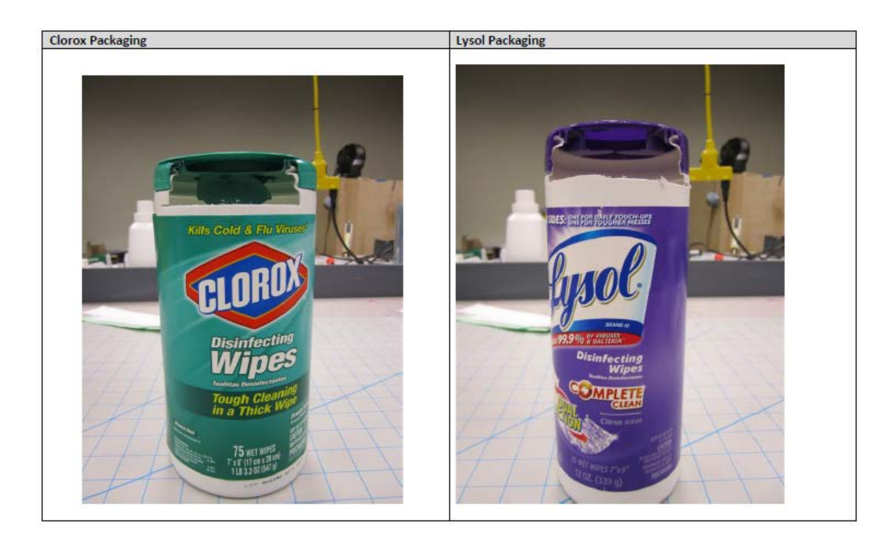
Case 1:20-cv-00623-UNA Document 1-5 Filed 05/08/20 Page 3 of 3 PageID #: 56

Case 1:20-cv-00623-UNA Document 1-5 Filed 05/08/20 Page 2 of 3 PageID #: 55